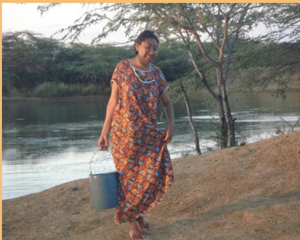
Wayüü woman collects rainwater from the jagüey, for consumption by the community's animals.

in decision-making from communities who hold the knowledge. Interactions between science and ILK systems do not always consider the rights of indigenous and local communities, and the benefits deriving from the research, as a central part of the collaboration. In some instances, the ILK is used by science for worthwhile purposes and the results of this collaboration are not shared back with the communities, or worse, are not used to improve their local conditions or to enable the development of appropriate policies that can improve their livelihoods and resilience. Participants explained that this perception of sciences leads to distrust, losing hope and unwillingness to cooperate among indigenous peoples and local communities.