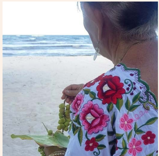
U k'ubil k'áanáab (offering to the sea) is an act of gratitude of the Mayan people to the force of the sea.

talk; under the appropriate circumstances they do so. In other instances, they speak “through the men” who voice what they have heard from the women. The experience in Belize emphasized active participation of women through the organization of their own discussion tables with translators during water ecosystem inventories, and the inclusion of young women to do the reporting.